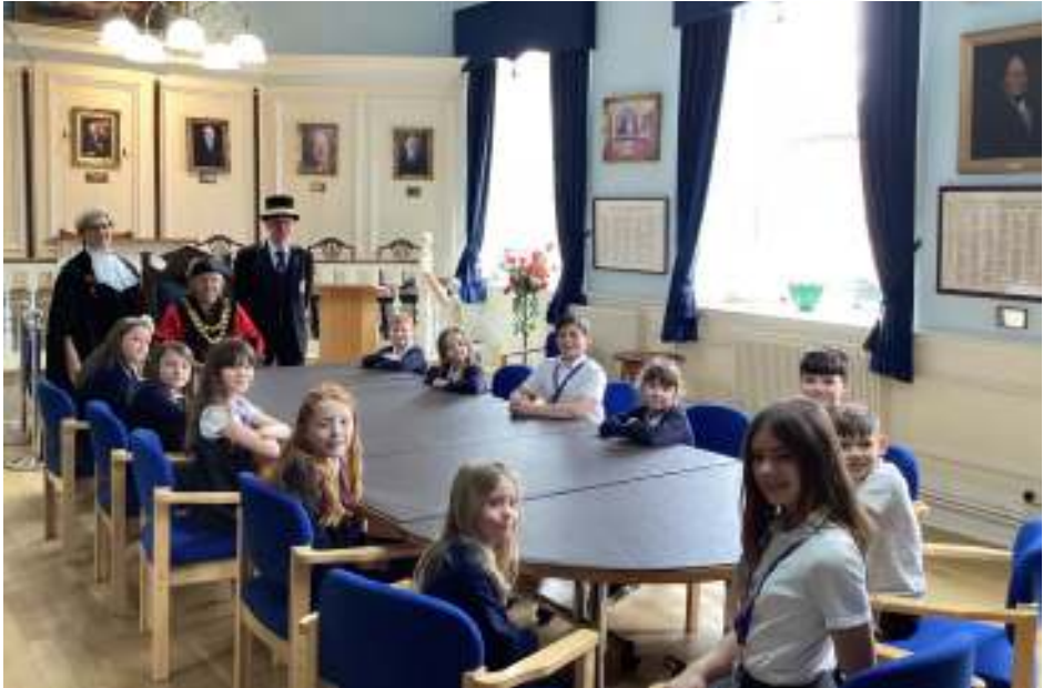
Keyingham School Student Council being hosted by the Mayor, Town Clerk and Mace Bearer in full regalia. At Hedon Council Offices.